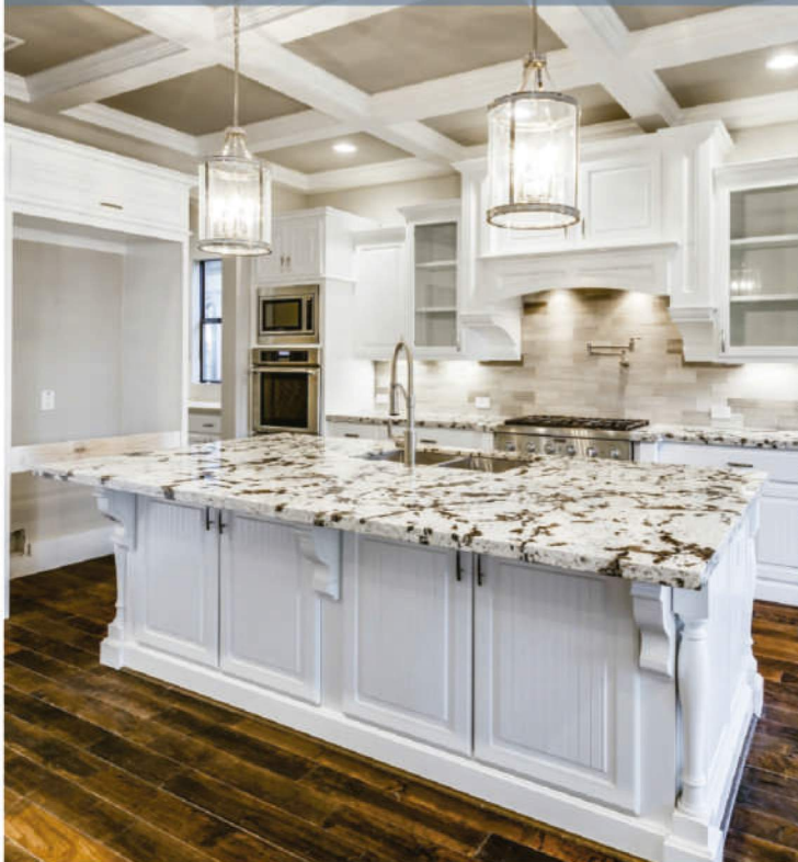
Bellaire Kitchen of Dreams