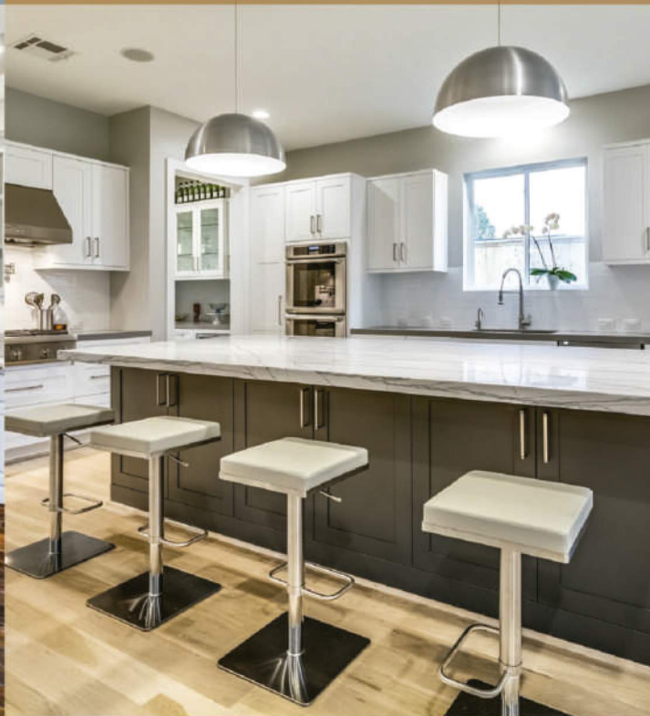
Contemporary Afton Oaks Kitchen