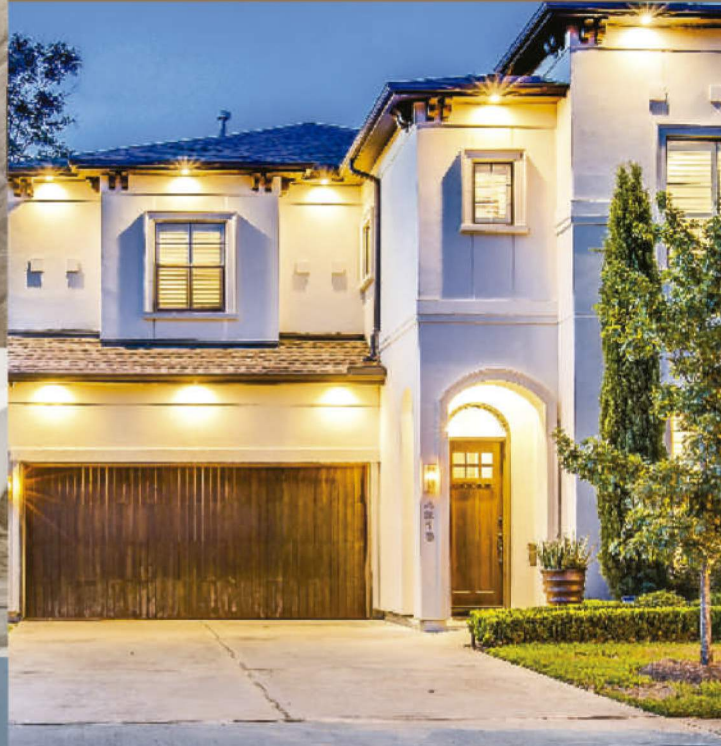
West University Home with a Mediterranean Feel