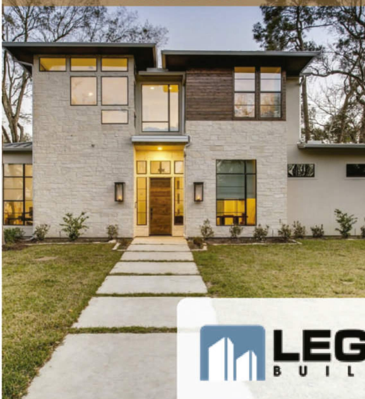
Soft Contemporary in Oak Forest