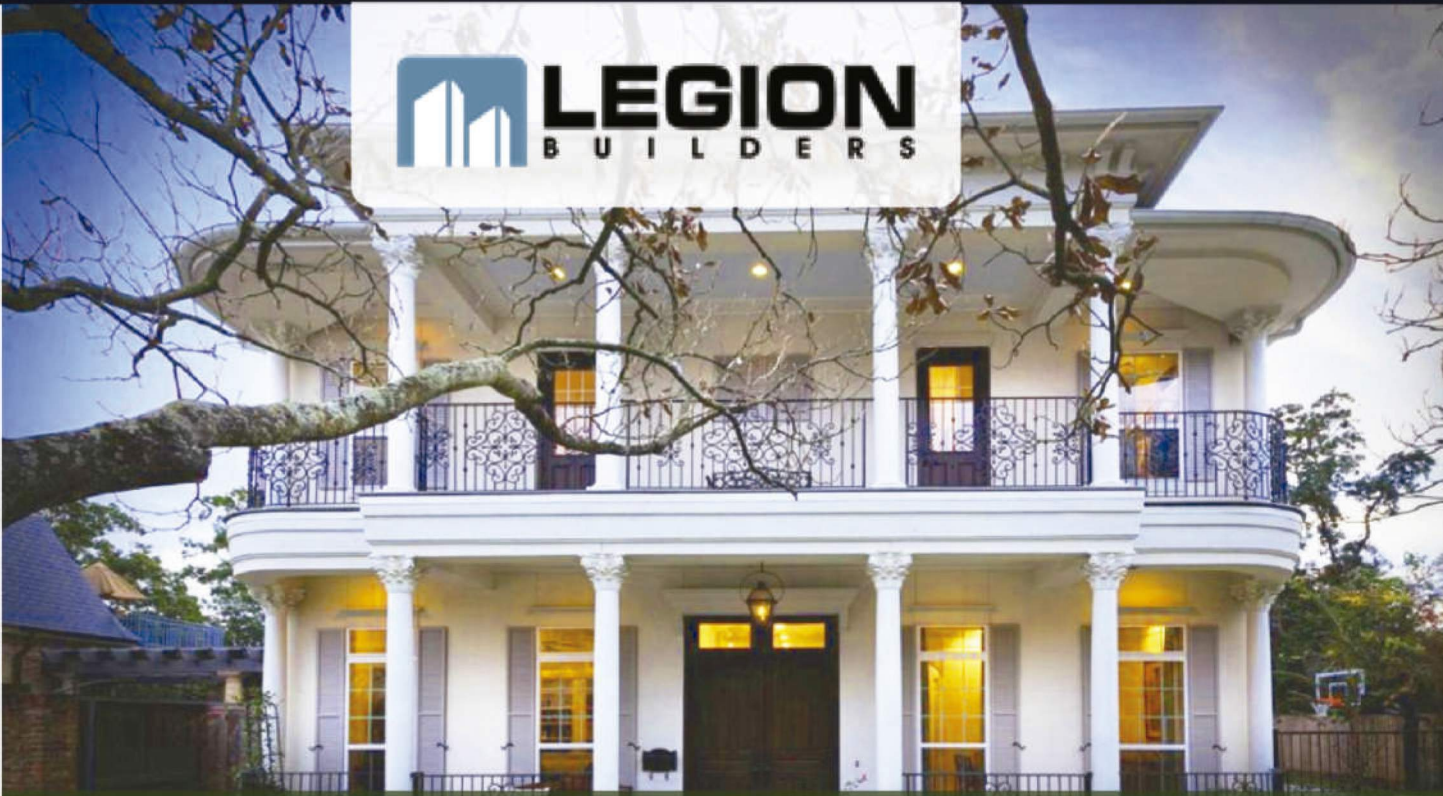
French Creole Inspired Home in Medical Center